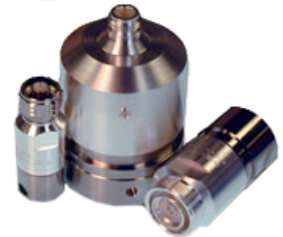
RAPID FIT™ Connectors