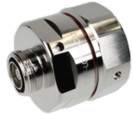
OMNI FIT™ Standard Connectors

OMNI FIT™ high performance connectors are designed for use with both CELLFLEX® (copper) and CELLFLEX® Lite (aluminum) cables. They are designed specifically to provide the highest quality connector-cable interface while simplifying and speeding up connector attachment. All RFS connectors are fully tested for mechanical and electrical compliance to industry specifications. The 7-16 connector is the most rugged RF connection meeting all requirements even under the most severe environmental conditions.