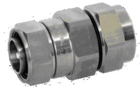
OMNI FIT™ Premium Connectors

The 7-16 connector is the most rugged RF connection meeting all requirements even under the most severe environmental conditions. Sealing against outer conductor and jacket by means of O-Ring and 360° compression fit. Multifunctional, self-lubricating HighTech polymer assembly locks on cable corrugation, avoids electrochemical potential differences and compression-fits to the jacket.