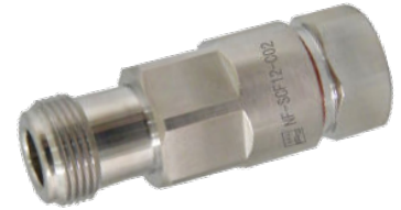
OMNI FIT™ Standard Connectors

OMNI FIT™ high performance connectors are designed for use with both CELLFLEX® (copper) and CELLFLEX® Lite (aluminum) cables. They are designed specifically to provide the highest quality connector-cable interface while simplifying and speeding up connector attachment. All RFS connectors are fully tested for mechanical and electrical compliance to industry specifications. The N connector is one of the most common RF connector types and meets all requirements even under the most severe environmental conditions.